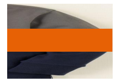
School Colors: Main colors: Burnt Orange and Navy Blue Accent Color: Gray