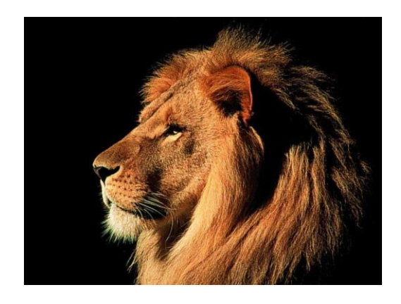
School Song: To be determined

Student and Teacher Prayer: God bless us to receive supernatural wisdom and reveal in us our passion and your will for our lives. Give us a fresh anointing for this day as we reverence you and depend on your strength in our times of weakness.